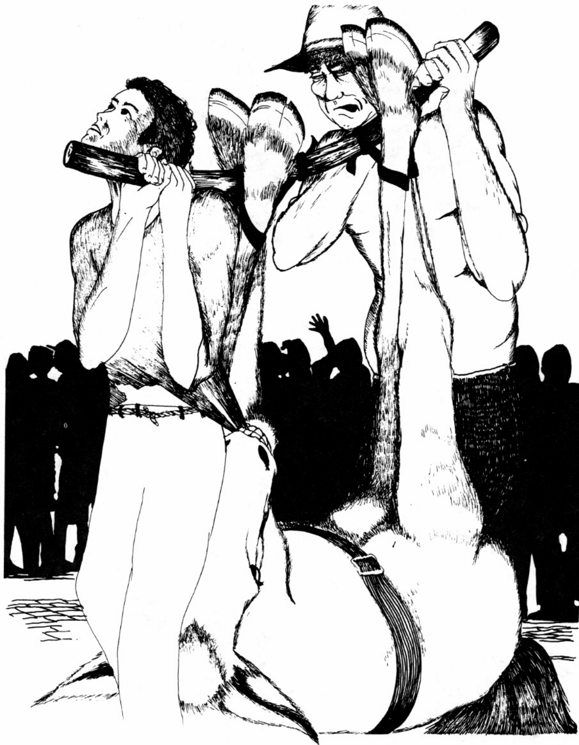
The farmer carries one end of the pole and the boy carries the other end.